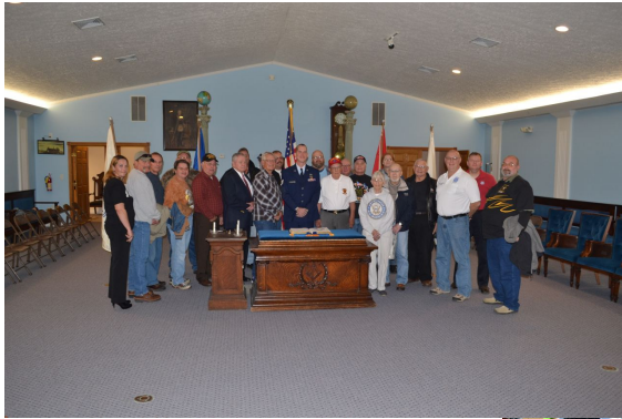
Honoring our Veterans!