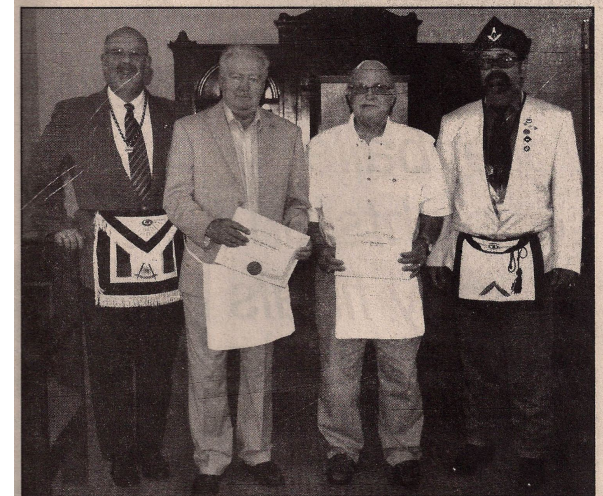
50-year Master Masons