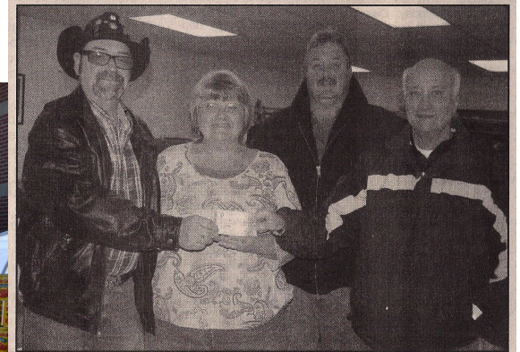
Quincy Masonic Lodge makes donation