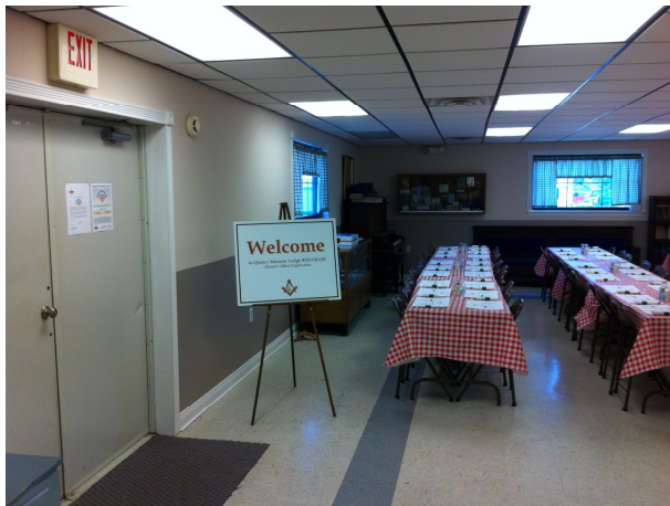
Under Wor. Bro. Kevin Osborn's direction, the Lodge dining hall renovations transformed the area into a showcase of Masonic pride!

2014 2015 2016 2017 2018 2019 2020 2021 2022 2023