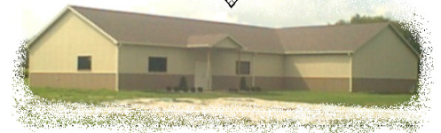
Quincy Lodge No. 230 F & AM 1136 North Anderson Street Elwood, IN 46036